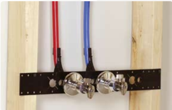
ProPEX Out-of-the-Wall Support System