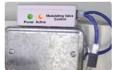
Figure 2: Electrical Box Mounting