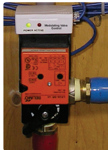
Figure 1: Belimo Valve Mounting

Mount the control to the conduit connection on the back of a Belimo valve (see Figure 1 ) or a separate electrical box using a standard 1/2-inch conduit hub (see Figure 2 ).