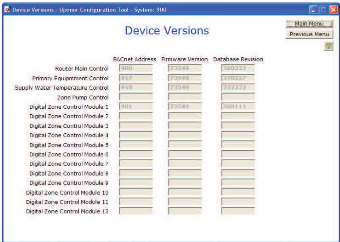
Figure 4.9-3: Device Versions Screen

Toll Free: 888.994.7726 Fax: 306.721.3088